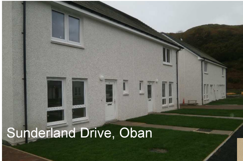
Sunderland Drive, Oban