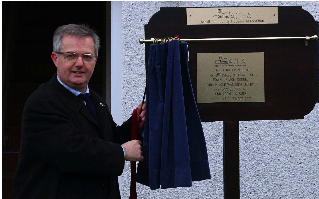
Brendan O'Hara MP opens the new homes at Powell Place, Connel on 1 st December 2017