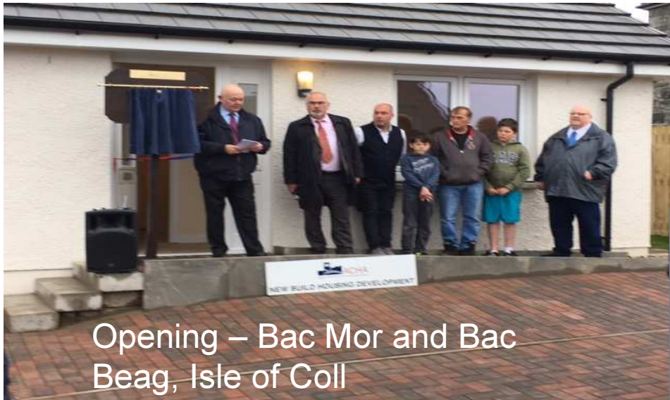
Opening – Bac Mor and Bac Beag, Isle of Coll