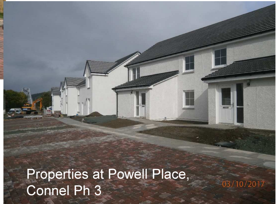
Properties at Powell Place, Connel Ph 3