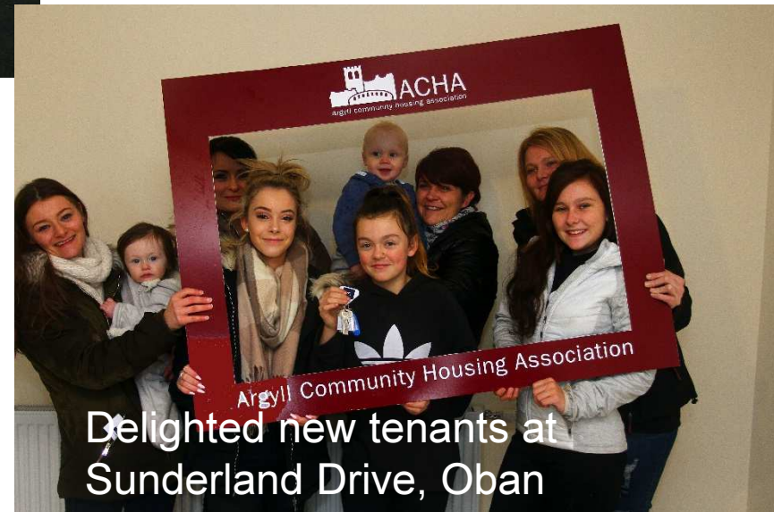
Delighted new tenants at Sunderland Drive, Oban